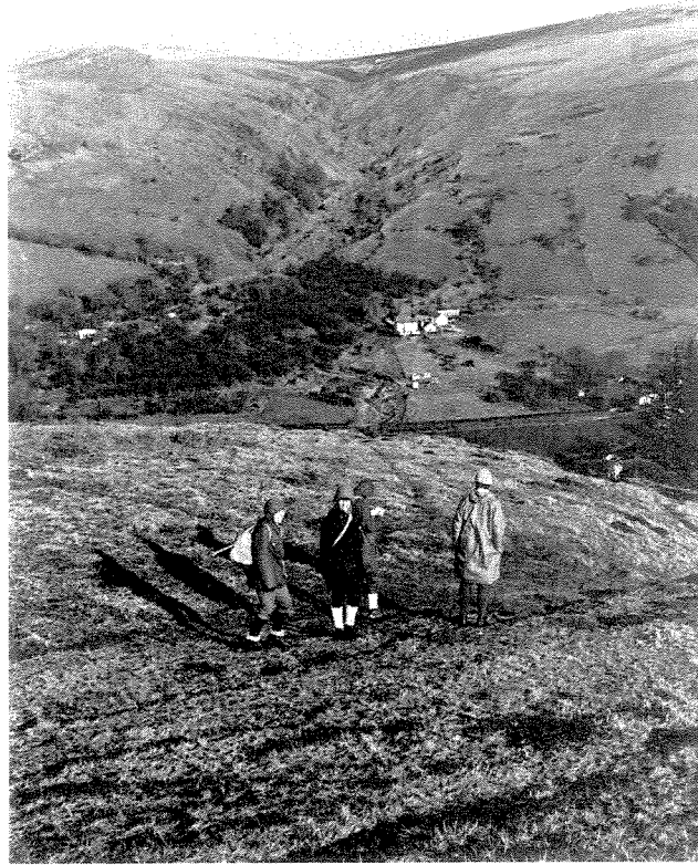
Above Pwll Coediog