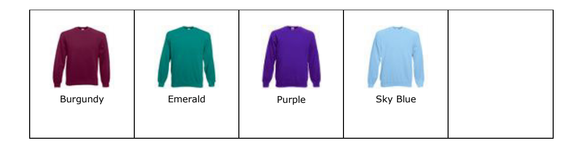
Size Chest (to fit) S - 35/37" M - 38/40" L - 41/43"